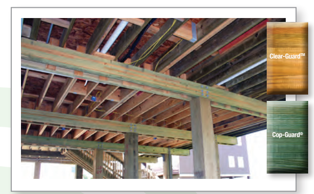
Raised Beach Home

With the shortage of high quality, high strength, solid southern pine treated timbers, Anthony offers Power Preserved Glulam® beams which have been pressure treated with Hoover Cop-Guard® or Clear-Guard™ at retention levels suitable for above ground uses. Power Preserved Glulam® products will resist fungal decay and wood-destroying insect attacks including the Formosan termite and is covered by a 25 Year Warranty by Hoover.