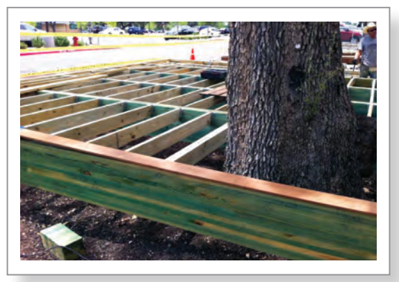
Austin, TX deck